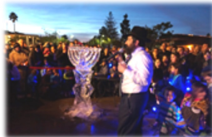
Our "Ice Menorah"

We just had a massive Chanukah event with around 300 people, there was a public "Ice Menorah" lighting. We made it in a massive supermarket, while many people were shopping. We ended up making all the doughnuts ourselves,